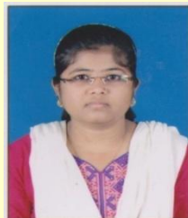
Rinal Kamate Qspiders, Bengaluru