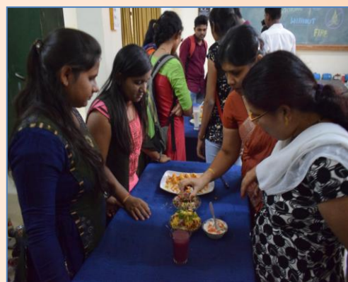
COOKING WITHOUT FIRE