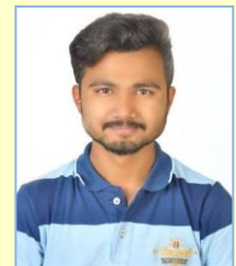
Surajkhan Pinjar Qspiders, Bengaluru